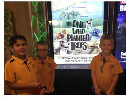
Queens Park Theatre 3rd May 2024